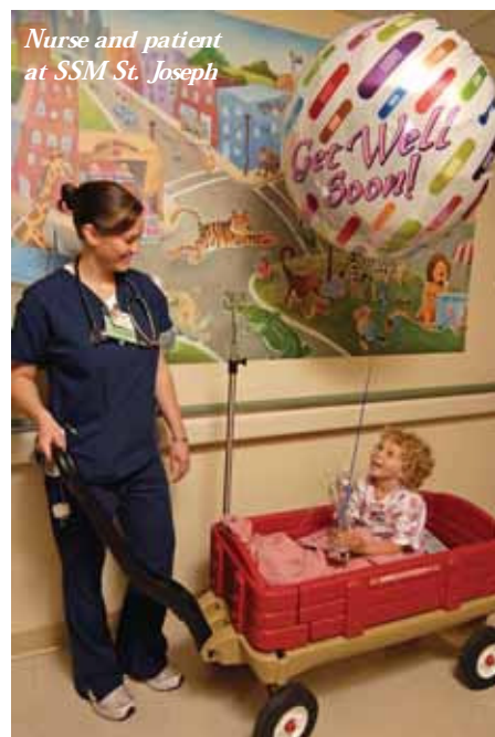
Nurse and patient at SSM St. Joseph

Progress West HealthCare Center and Barnes-Jewish St. Peters Hospital have teamed up with the St. Charles County Library District to provide a unique resource for St. Charles County residents. The Middendorf-Kredell Library Branch, located on Highway K in O’Fallon, Missouri, is home to a consumer health information resource center that’s designed to help consumers make wise choices about their health care.