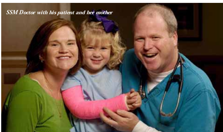
SSM Doctor with his patient and her mother

The Consumer Health Information section has an extensive collection of materials and electronic resources on health-related issues and dedicated library staff is available to help customers research their desired health information.