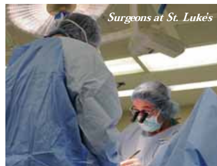
Surgeons at St. Lukes

In 2007, St. Joseph Health Center was one of 12 hospitals in the nation to receive the Premier Award for Quality for excellence in patient care in the area of Acute Myocardial Infarction (AMI). The hospital was also the first winner of the MissouriPRO Quality Award for outstanding heart attack care in 2006