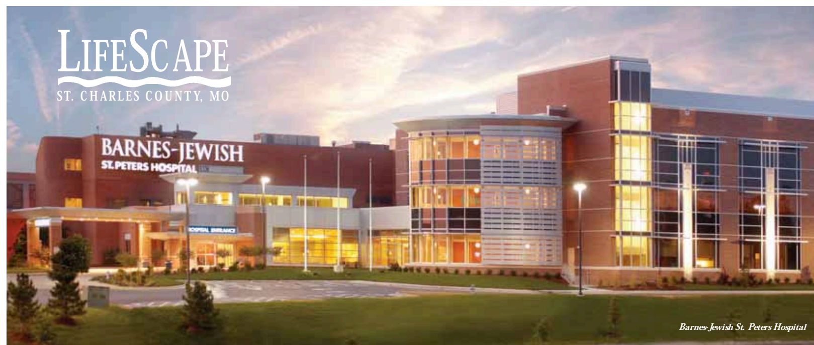
Barnes-Jewish St. Peters Hospital