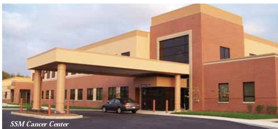
SSM Cancer Center

With the opening of the SSM Cancer Care at SSM St. Joseph Hospital West in fall 2008, the Lake Saint Louis campus now provides one of the most sophisticated cancer treatments available: the CyberKnife®, operated by Saint Louis