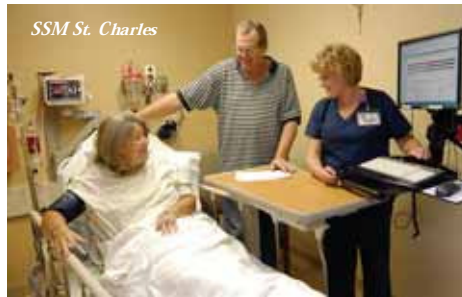
SSM St. Charles