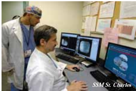
SSM St. Charles