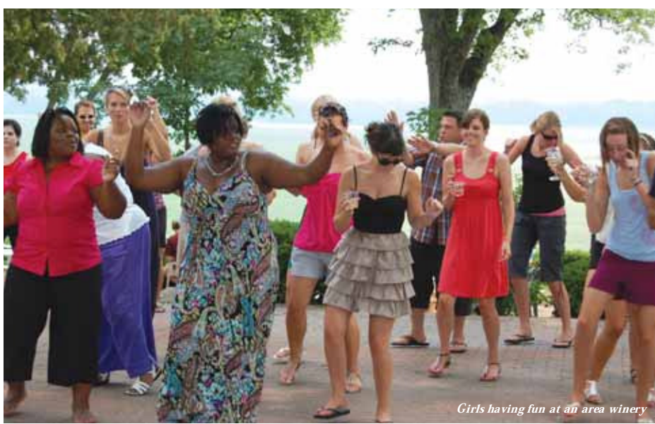
Girls having fun at an area winery