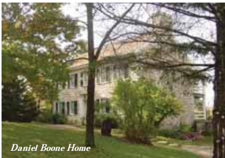
Daniel Boone Home