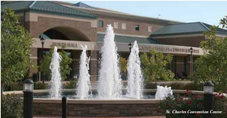
St. Charles Convention Center

Find out more about local attractions by calling the Greater Saint Charles Convention and Visitors Bureau at 800-366-2427 or visit historicstcharles.com