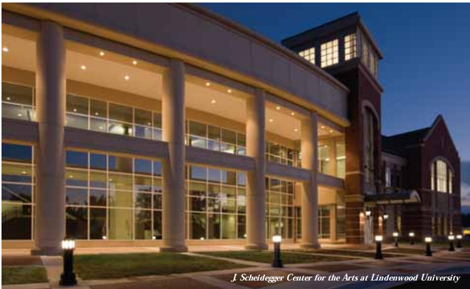
J. Scheidegger Center for the Arts at Lindenwood University