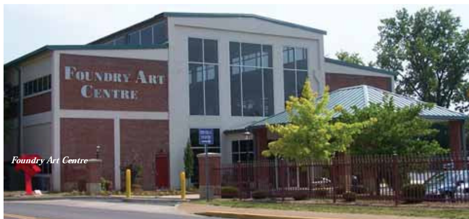
Foundry Art Centre

The Lewis & Clark Boat House and Nature Center is the Discovery Expedition's permanent home. Situated beside the Missouri River at Bishop's Landing in historic St. Charles, the educational facility features exhibits relating to the famous expedition as well as the Missouri River ecosystem. The display features a full-sized 55-foot-long reproduction of the explorer's keel boat, dioramas highlighting stages of the trip and a National Geographic film on the expedition. The center is located in Frontier Park which hosts special events year-round such as Riverfest and Festival of the Little Hills. Visit lewisandclarkcenter.org