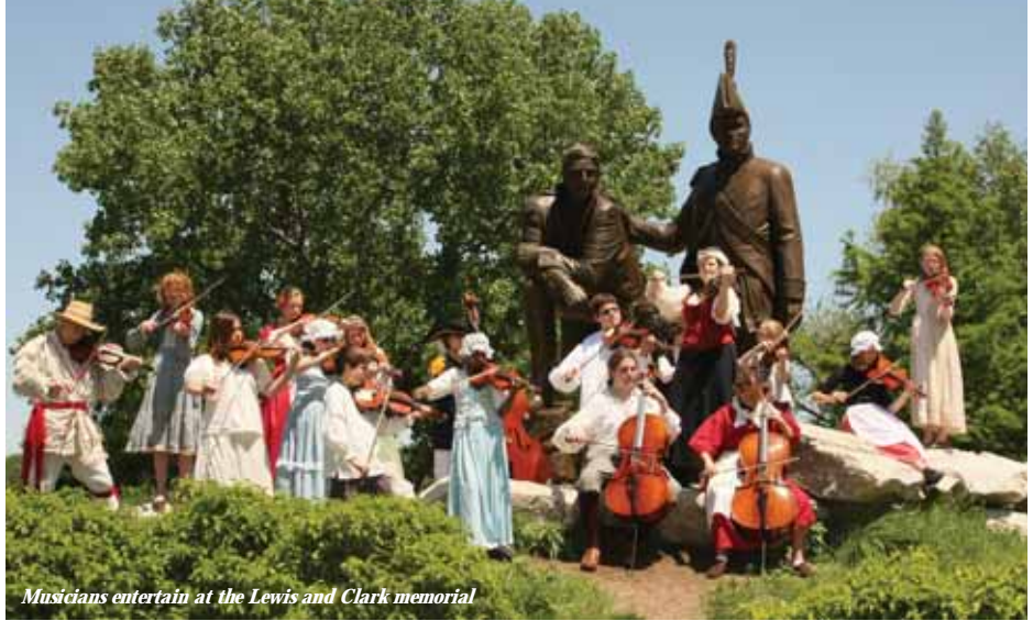
Musicians entertain at the Lewis and Clark memorial