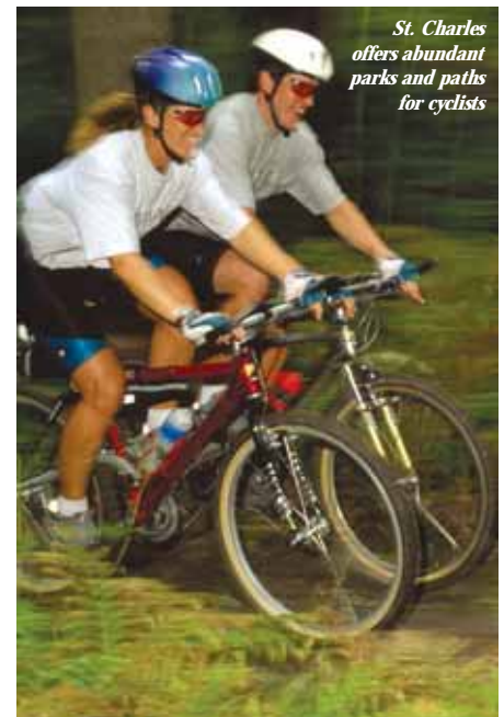
St. Charles offers abundant parks and paths for cyclists