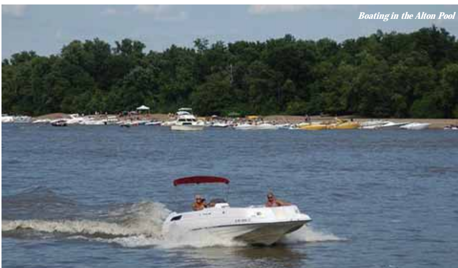
Boating in the Alton Pool