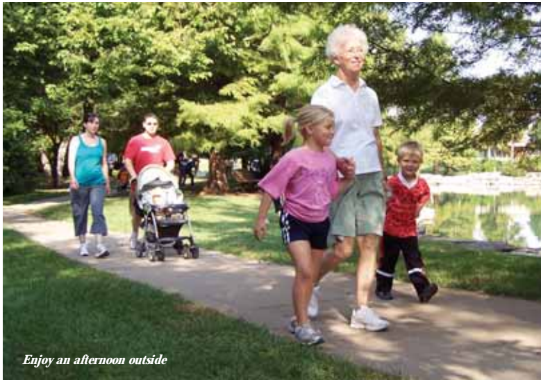
Enjoy an afternoon outside

With more than 23,000 acres of total parkland and countless recreational facilities, the following are highlights from around St. Charles County.