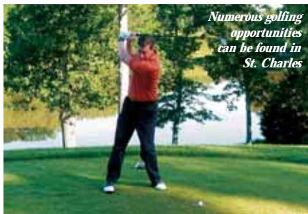
Numerous golfing opportunities can be found in St. Charles

A typical wooded Missouri River island, the land features 2.6 miles of natural surface trail for hiking and mountain biking. Wildlife abounds, offering opportunities for both viewing and pho-