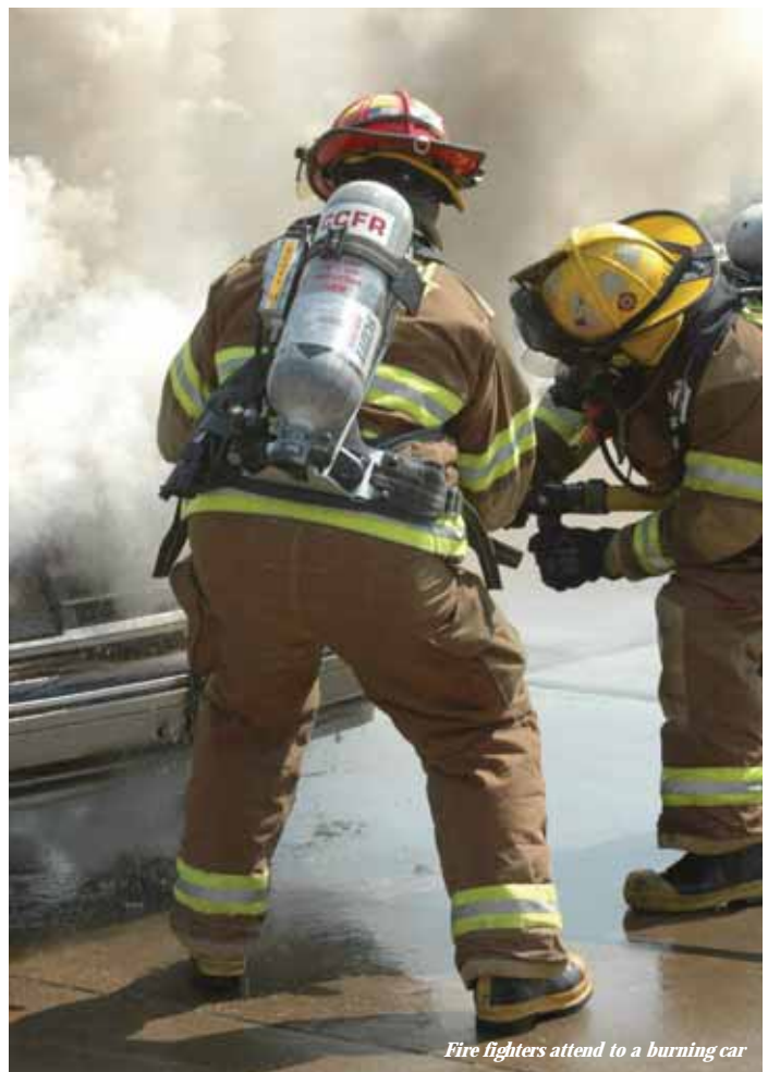
Fire fighters attend to a burning car

The United Way of Greater St. Louis, Inc assists thousands of people in 16 Missouri and Illinois Counties, including St. Charles County through both health and social service agencies. The local division of the Tri-County United Way serves