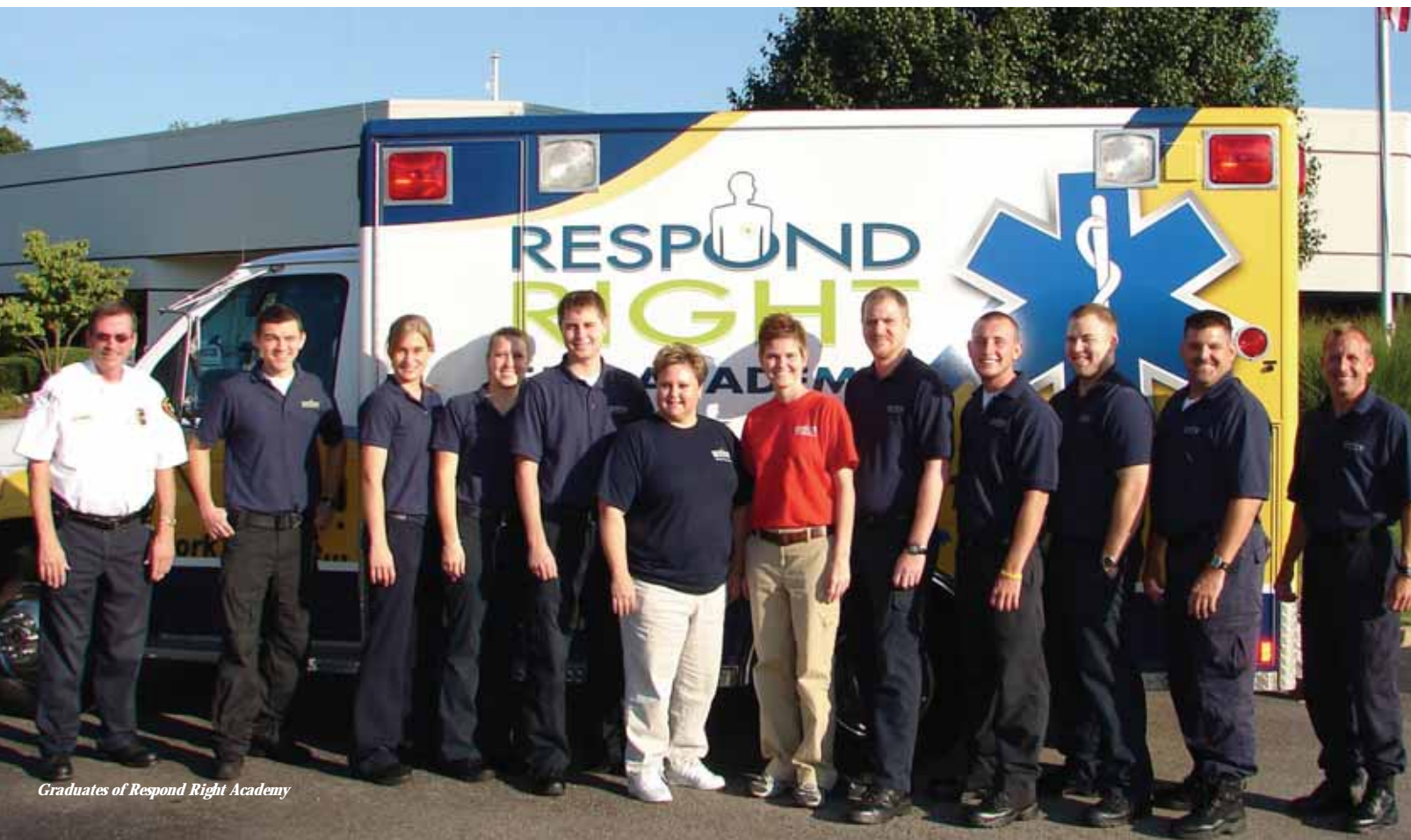
Graduates of Respond Right Academy

...the abundance of professional agencies in St. Charles County are making a real difference in the community.