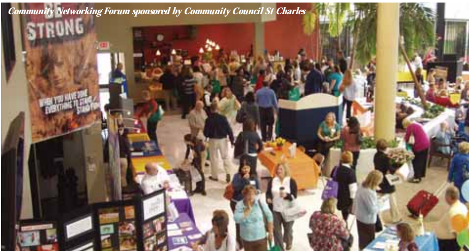
Community Networking Forum sponsored by Community Council St Charles