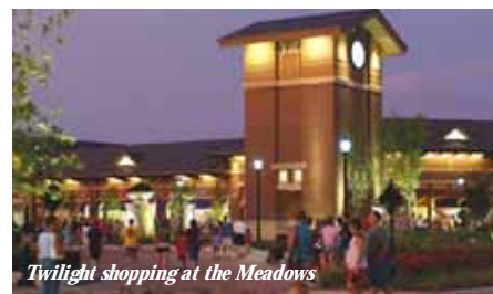
Twilight shopping at the Meadows

required at this charming venue that is open only a few evenings a week for four and six course tasting menus. Champagne Brunch is served Sunday mornings.