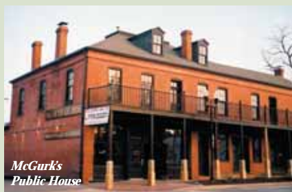
McGurk's Public House