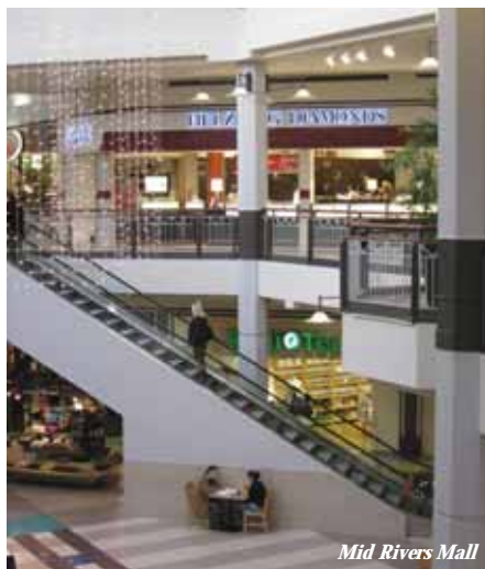
Mid Rivers Mall

Whatever the occasion, craving or budget, local residents and guests will find plenty of mouth-watering options and distinctive flavor on the menu, thanks to the many award-winning establishments.