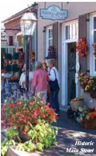
Historic Main Street

One of the new shopping trends making its mark in St. Charles County is the emergence of “lifestyle centers” which combine trendy, upscale outdoor shop centers with urban styling, green space, and quick access parking.