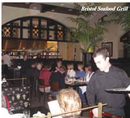
Bristol Seafood Grill

There's a hotel room for every occasion - whether it's to house visiting family members, an extended business trip or a night's stay during a long road trip.