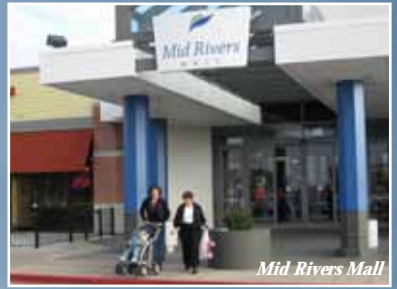
Mid Rivers Mall