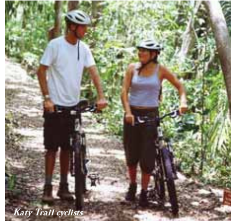
Katy Trail cyclists