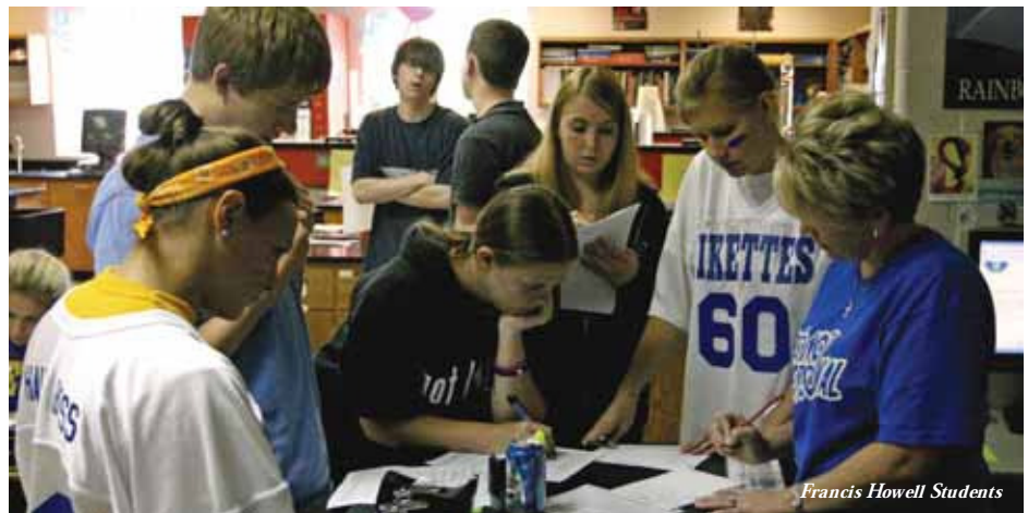
Francis Howell Students

With more than 23,000 acres of public parkland, the area benefits from an abundance of green space, parks, trails and other outdoor amenities