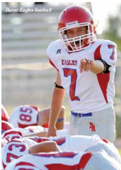
Barat Eagles football

Elements of distinction and excellence have come together in St. Charles County, Missouri, creating an unparalleled “quality of place” in the American heartland.