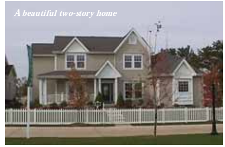
A beautiful two-story home

According to a 2007 national report by BusinessWeek.com, one of "the most affordable suburbs that offer the lowest crime rate, finest schools, and best quality of life for the dollar" was Wentzville. At number 25 on this national list, Wentzville was the only Missouri community singled out for this honor. In addi-