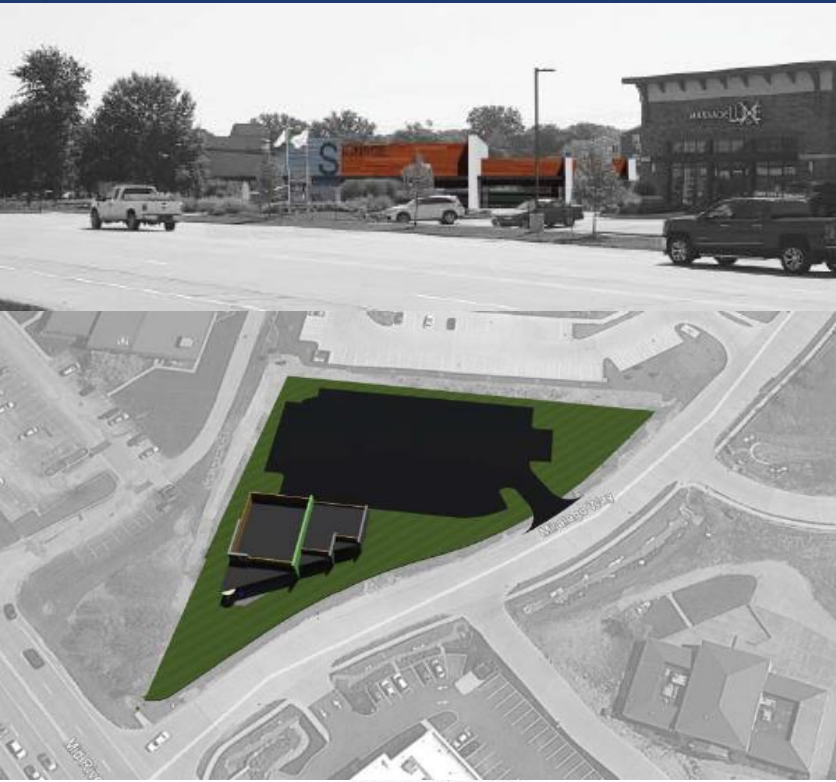
OF THE FIFTH PRINCIPAL MERIDIAN CITY OF COTTLEVILLE ST. CHARLES COUNTY, MISSOURI